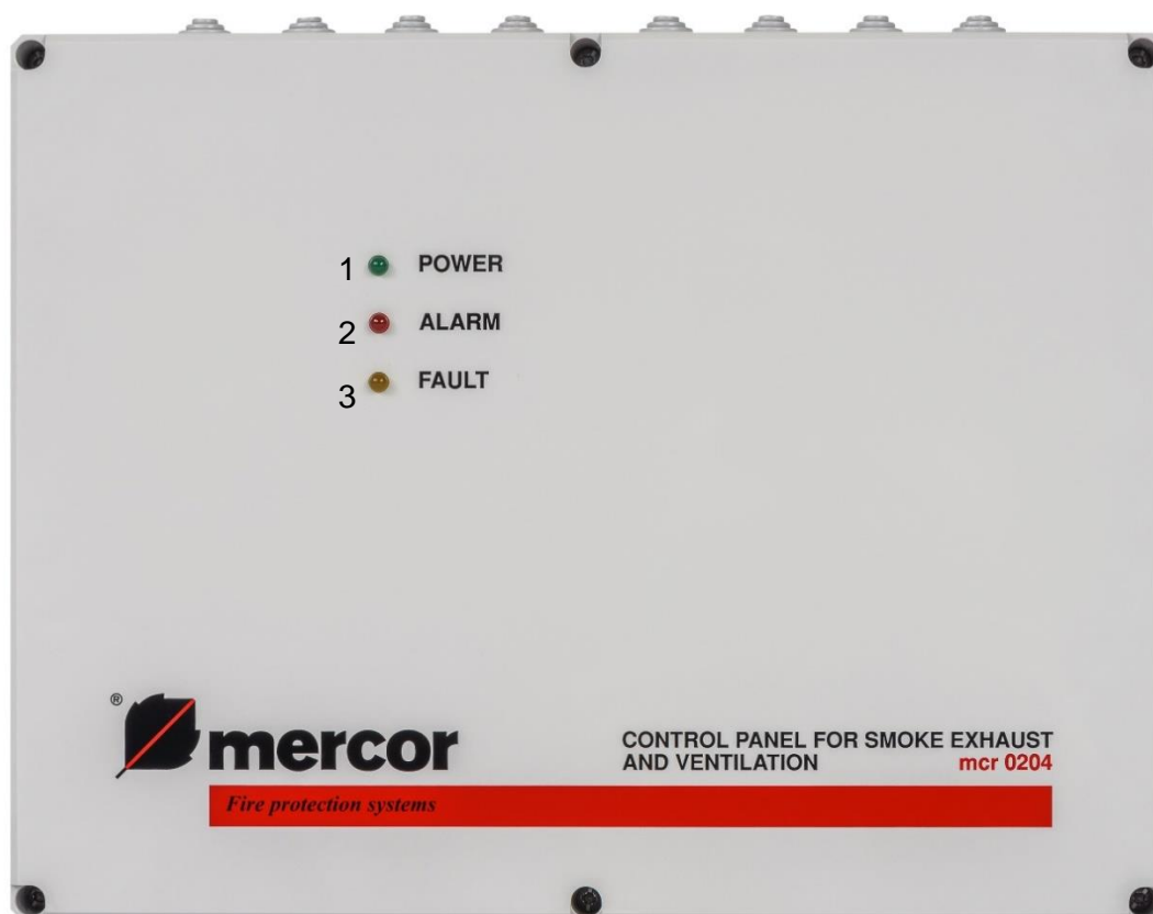
Fig. 1 Front panel of the unit.

On the front panel there are diode indicators which inform the user about the unit's status.